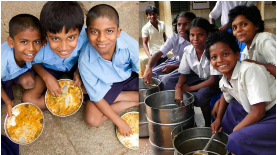
Representative Photo |

FP News Service | Updated: Wednesday, October 06, 2021, 11:52 PM IST